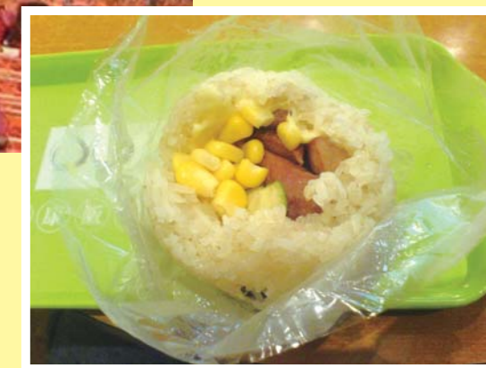
a delicious yet affordable meal @ the Hong Kong International Airport